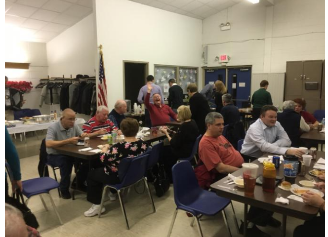
2015 Holiday Party at the Senior Center