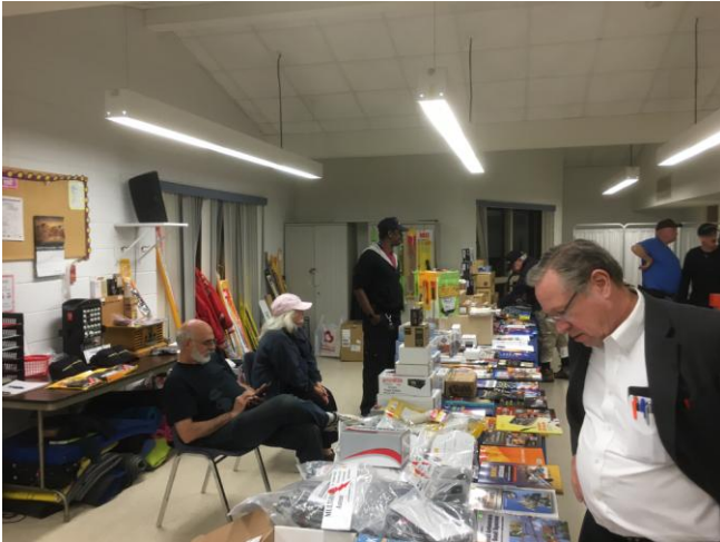
FLARC 2015 Auction