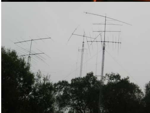
W4DUG Interior and Tower Array