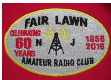
60th Anniversary Shirt Logo

Order the shirts or other items you want with either the regular FLARC or 60th anniversary logo.